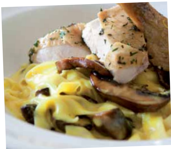
Creamy Mushroom and Chicken Tagliatelle